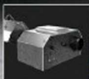
INFRARED RADIANT TUBE HEATERS