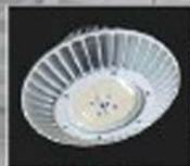
INDUSTRIAL LED LIGHTING

DETROIT MADE HEATING AND LED LIGHTING SYSTEMS BUILT TOUGH FOR YOUR AIRCRAFT HANGAR.